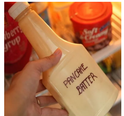
Plastic bottle pancake mix dispenser