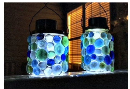
Glass jar solar light