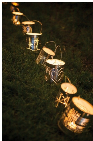
Tin can solar lights