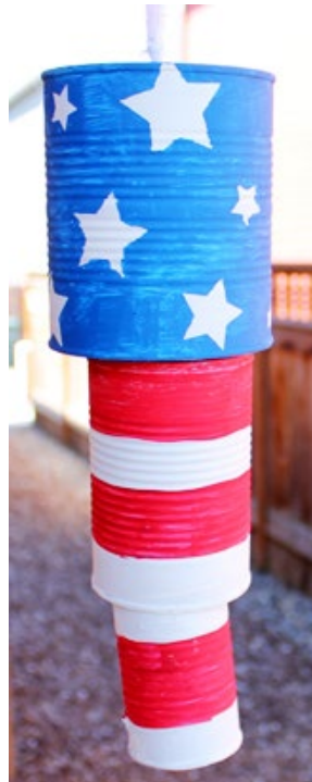
Tin can wind chime