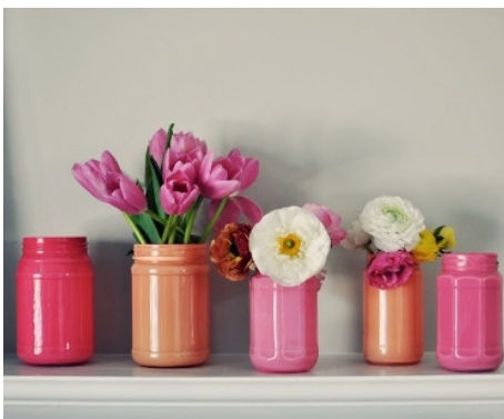
Painted glass jars for decor or a flower vase