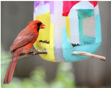
Milk jug bird feeder

You can upcycle, recycle, and repurpose nearly anything! Here are some projects and ideas!