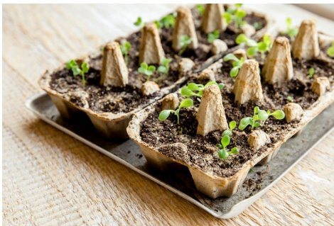
Egg carton seed sprouting container