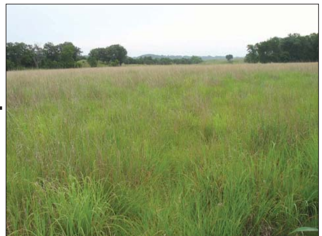
Pictured: This CREP easement in Renville County borders the Minnesota River.

Renville boasts the largest number of conservation easement acres through Reinvest In Minnesota (RIM) Reserve and CREP in Minnesota. SWCD staff continue to work with landowners on maintenance and improvement of their easement acres. In addition to offering advice and technical assistance, staff assist landowners with the process of obtaining funding from various sources. This requires a positive working relationship and partnership with USDA offices, U.S. Fish and Wildlife Service personnel and DNR private lands specialists.