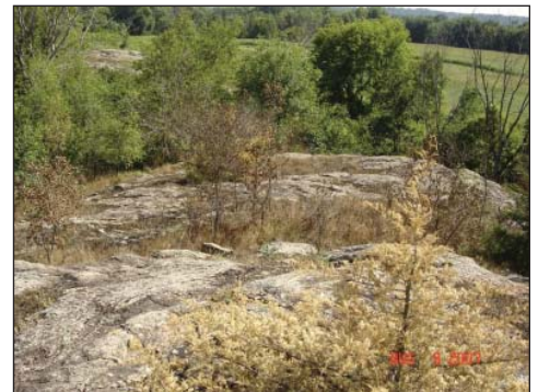
Pictured: Prickly pear cactus and other rare plants thrive in Granite Rock Outcrops like this one in Renville County.